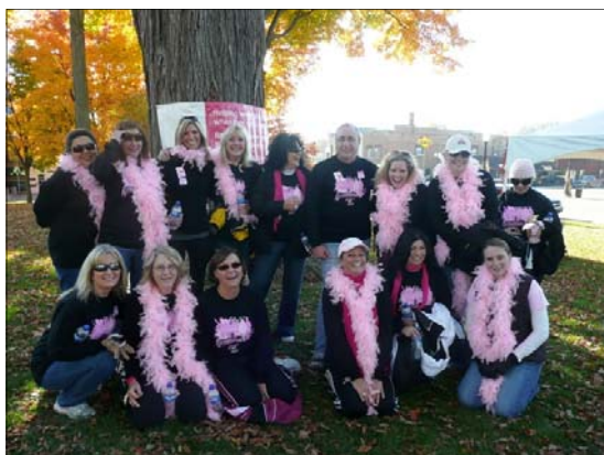
October Strides Walkathon in Howell