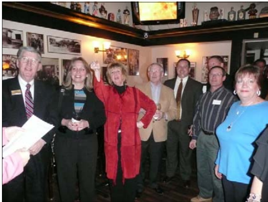
January Mixer at Burrough's New Member Induction