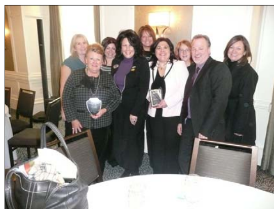
Our Chapter in Detroit for WCR State Awards